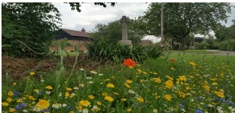
Memorial grounds – Junction Worlds end lane and School lane

We would like to say thank you to all the kind volunteers who helped water the areas whilst we were experiencing the long drought earlier in the year. Also thanking the lovely people of Weston Turville who commented as they passed by.