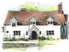
The Old Crown, West End